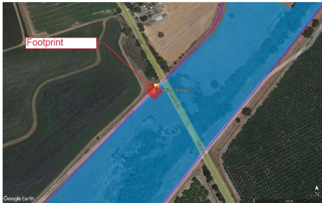
3) Approximate project footprint map