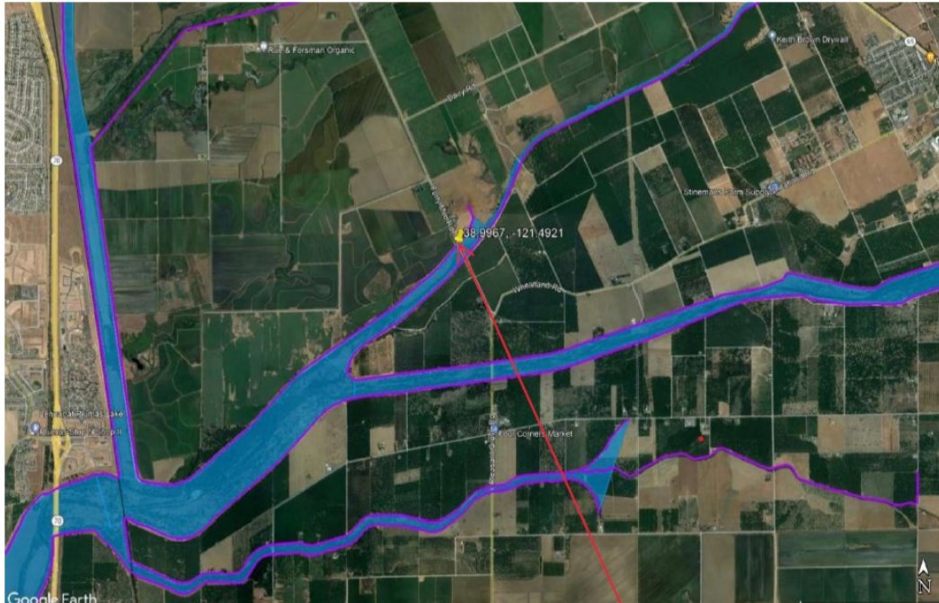
2) Proposed project location map